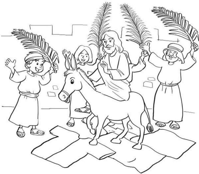
Color Jesus entering into Jerusalem.